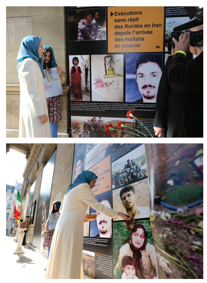
Hail to the martyred children of Kurdistan and all the oppressed ethnic minorities in Iran