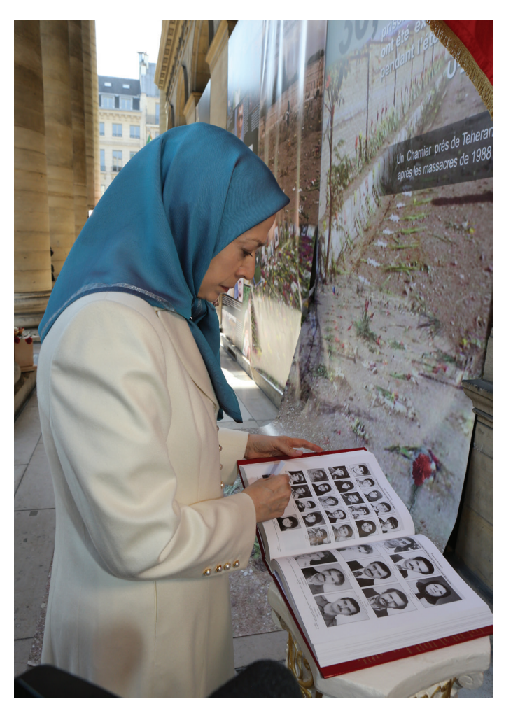
Remembering all those martyred and executed under the anti-human rule of the mullahs' religious tyranny

Iran without Death Penalty - EN - final.indd 33