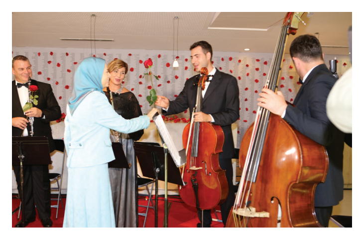
By their music, the people of Albania expressed their humane bonds with the people of Iran