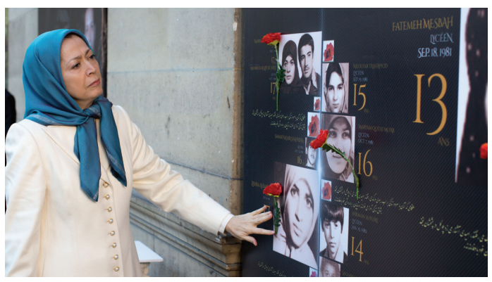
Execution of juveniles is the criminal mullahs' villainy against Iran's younger generation