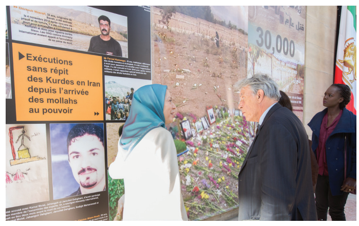
Dignitaries participating in the conference visited the exhibition on human rights violations in Iran