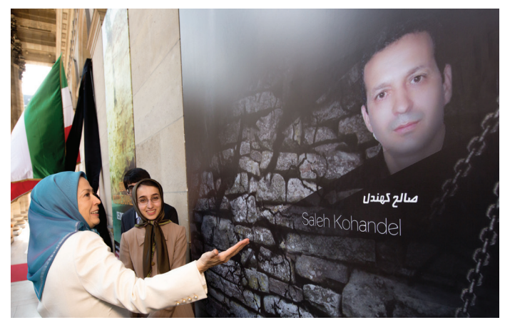
Meeting with families of martyrs and political prisoners, and lauding the resistance of political prisoners in Iranian regime's jails