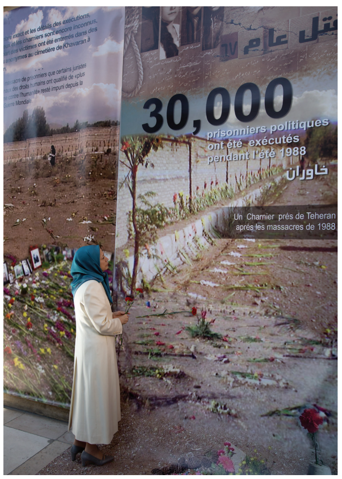
In memory of 30,000 political prisoners massacred in summer 1988