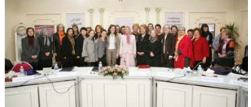
A conference on solidarity with women in the Iran uprising and in Camp Ashraf was held on March 5, 2010, at the headquarters of National Council of Resistance of Iran. Mrs. Rajavi and equality movement activists from Europe, North America and the Middle East spoke at the conference