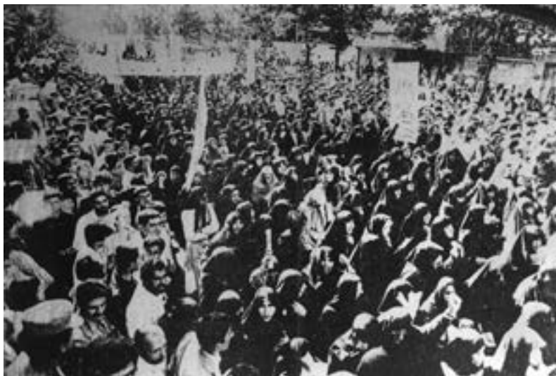
A major demonstration in Tehran on invitation of PMOI mothers, held on April 27, 1981, to protest the killing of PMOI sympathizers, in particular two young PMO female supporters by the regime's agents

This rich precedent of resistance revealed itself most prominently in the uprisings that have erupted in Iran since June 2009. Iranian women have participated on a large scale