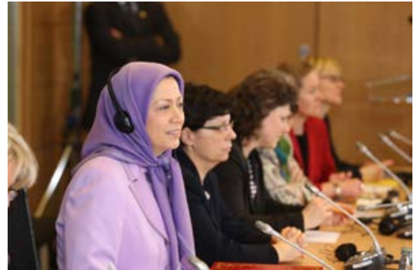
Mrs. Rajavi in meeting in solidarity with Iran uprising and the women in Ashraf in Berlin, on March 24, 2010. Women from different German political parties attended the meeting