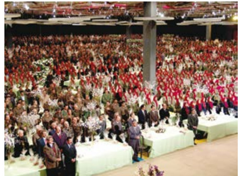
Thousands of residents of Ashraf in a gathering at the Camp

The Iranian Resistance has the requisite political and social capacities to bring about democratic change in Iran. The most significant weapons in our arsenal are: An extensive social base; the presence of 3,400 resistance activists in Camp Ashraf, Iraq, many of whom have been involved in the struggle for freedom for over three decades; with an organization and a progressive and legitimate ideology.