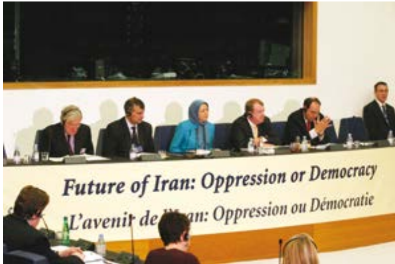
In her speech at the European Parliament on December 15, 2004, Ms. Rajavi announced her 'third option' in dealing with the Iran crisis

I call on all movements that advocate peace and human rights, in particular the equality movement, to support this third option. I urge all my sisters who work for peace on both sides of the Atlantic to stand firm and refuse the clerical regime's efforts to rob women of the fruits of their struggle in an attempt to prolong its own rule.