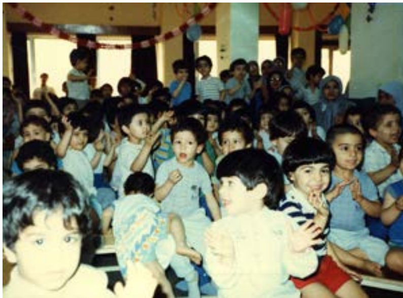
PMOI children in kindergartens and schools in Ashraf and other camps prior to 1991

country afflicted with war, and the PMOI was the target of continuous bombings and terrorist attacks. For this reason, it became impossible for the families to get together in Ashraf City or other PMOI bases in Iraq. PMOI members had two options: Abandoning their full-time struggle and leaving the arena, or sacrifice everything to keep the flames of the Resistance burning.