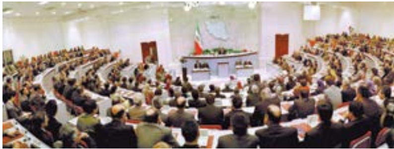
Plenary session of the National Council of Resistance of Iran

Resistance's parliament-in-exile - 52% of the seats belong to women. I should, in particular, mention Camp Ashraf here. Based in Iraq, Ashraf is home to 3,400 members of the PMOI and is entirely led by women. Leading Ashraf was a colossal test for women in the Resistance, especially in light of the fact that it has continuously been the target of bloody assaults and conspiracies by the mullahs and their mercenaries and operatives in Iraq.