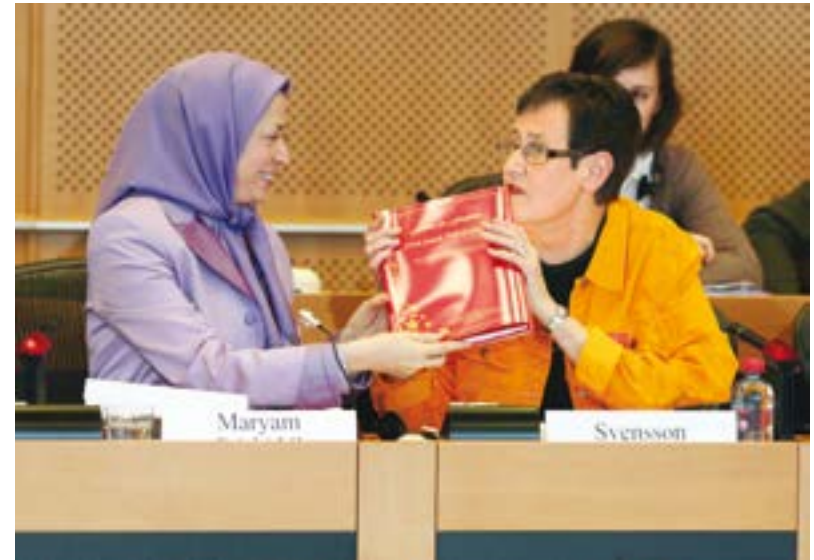
In her speech at the European Parliament on February 23, 2010, Mr. Rajavi presented a book containing the names and photographs of 2,700 PMOI women executed or tortured to death by the Iranian regime

Rape is the primary form of torture used against women in the prisons and other suppressive centers. After all other kinds of torture and executions fail to pacify women, and when the torturers are forced to kneel in the face of the power of the resistance of female political activists and members of the People's Mojahedin Organization of Iran (PMOI/MEK), the final weapon of the animalistic nature of the savage male, i.e. rape and defaming of women, comes into play by the mullahs and the members of the Islamic Revolutionary Guard Corps (IRGC). The most despised henchmen in the regime's prisons, such as Asadollah Lajevardi and Haj Davoud Rahmani, have been known for resorting to this