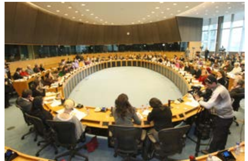
A meeting, entitled «Women, Pioneers of Democratic Change in Iran,» was held on February 23, 2010, at the European Parliament. President of the EP's Commission on Women, two EP vice presidents and MEPs attended the conference.