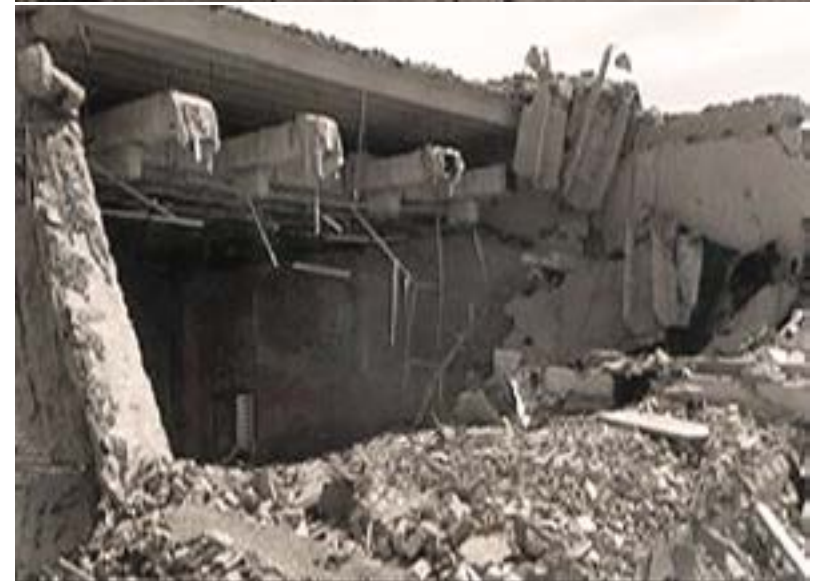
Despite PMOI's publicly declared neutrality in the 2003 Iraq war, its bases were heavily bombed by the coalition forces